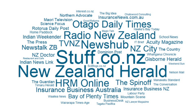
Figure 1: Article sources by prevalence

We distilled the media coverage into four phases as defined by the New Zealand Government's COVID-19 response to the outbreak since March 2020, using the timeline of key events published by the Ministry of Health as a reference.